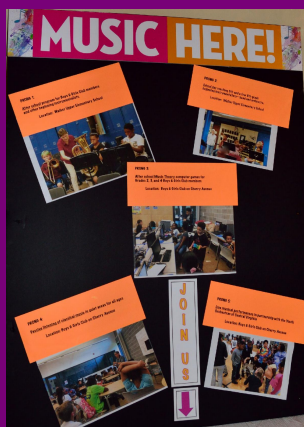
Music Here! Program