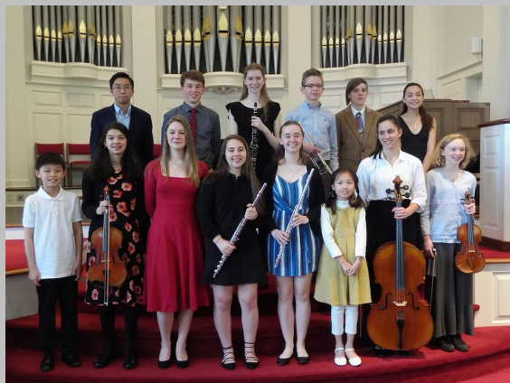
2020 WMC Competition Winners

The application deadline for this year's Annual Competition (virtual) is midnight on January 11, 2021. Please click here for additional information.