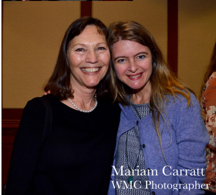
Mariam Carratt WMC Photographer