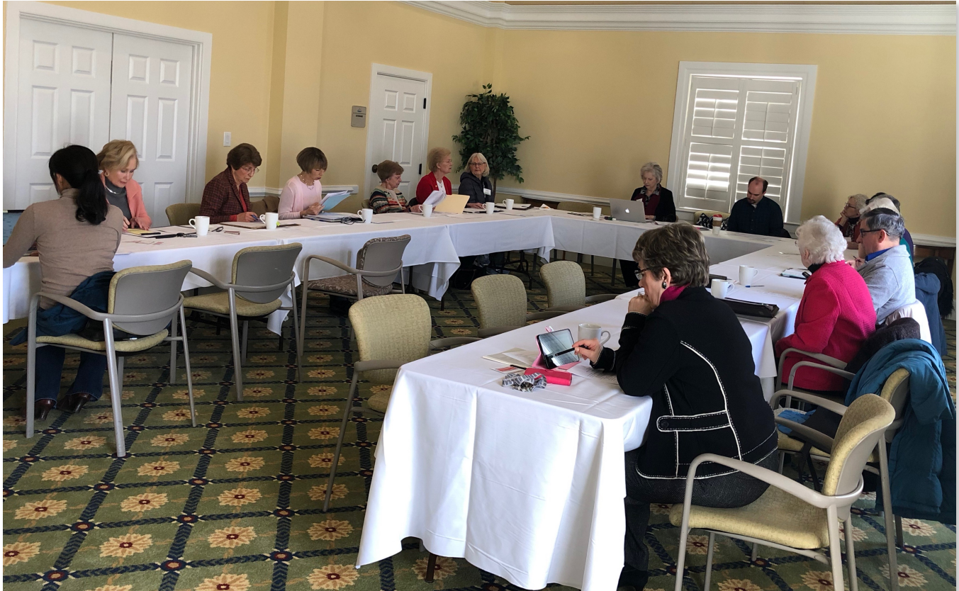
WMC Board at the January 9, 2019 Board Meeting Westminster Canterbury of the Blue Ridge

Due to the great number of musical events taking place in our community, WMC developed a policy some time ago about announcements as follows: